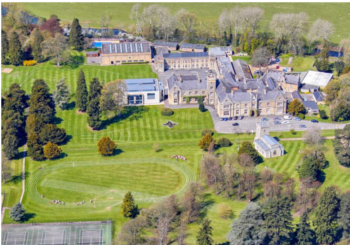
The beautiful grounds of Thornton College