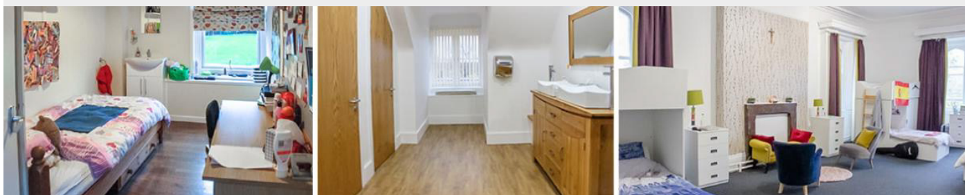
Spacious and modern Accommodation and Bathroom