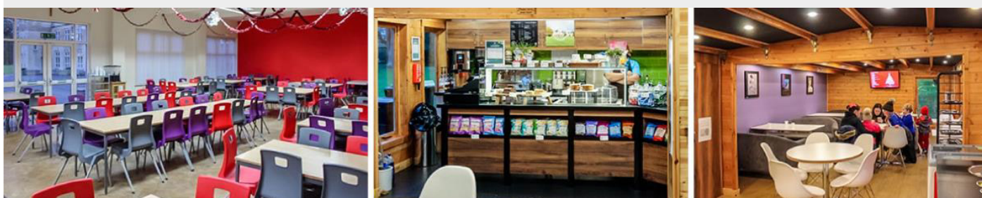
Modern Canteen and cosy Café