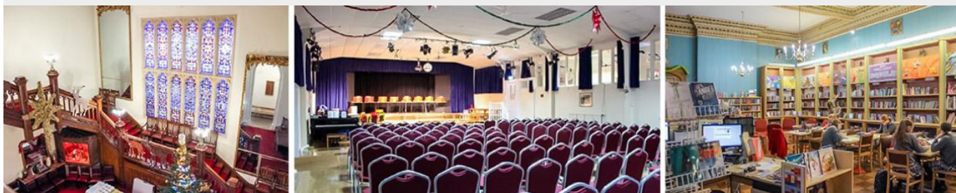
Impressive Entrance hall, Theatre and library